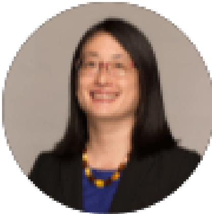
Public Health in Action