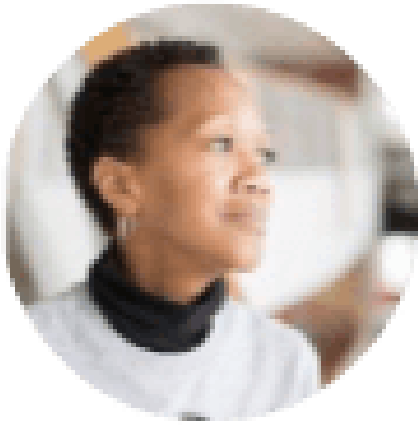
Breaking Down Silos