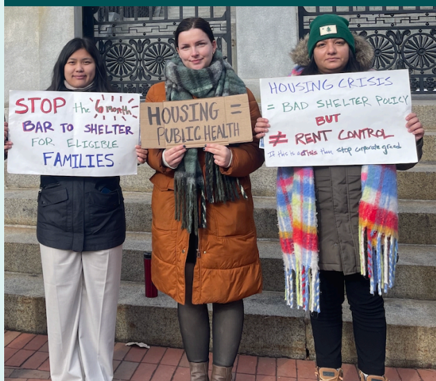
MPHA staff at "People's State of the Commonwealth" state house rally organized by grassroots housing advocates and coalition partners.

We rallied support that led to historic investments of $150M in FY24 and $160M in FY25 in regional transit. Accessible public transportation in communities that are too often left behind has already shown major improvements.